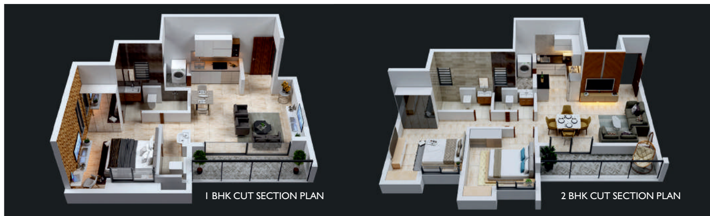
1 BHK CUT SECTION PLAN